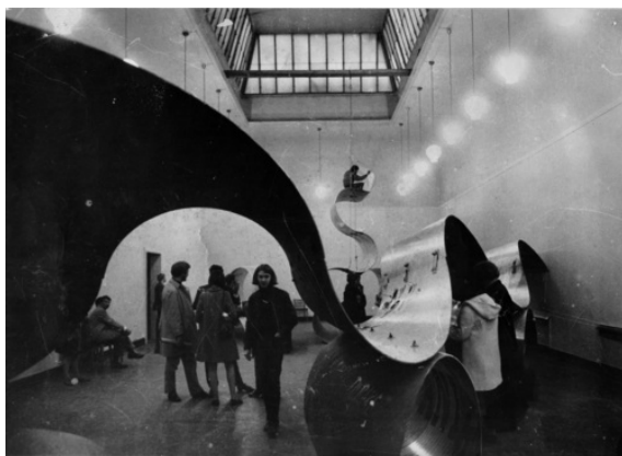
From the opening of Surroundings , Kunstnernes Hus 1969

EM: I've included the full image in the book, and in it you see the sheer size of the installation, which fills up the main hall at Kunstnernes Hus, all the way up to the ceiling. The piece incorporates the main traits of her work, both social and political, as mentioned before. The material she used was prefabricated, often oil pipes. Aurdal was interested in geometrics and mathematics, and she figured out a way of cutting these pipes, creating two curvy pieces that mirrored each other. She discovered that they could form the basis for her sculptural work, curving them into engaging structures for the viewer to climb or sit in. The political part was the environmental context, but also, especially in Surroundings , it worked as a speaker's corner, by inviting the viewer to write whatever they have in mind on the surface. What struck me was that a piece this momentous and timely had been forgotten. With this exhibition and the book, I want to make her invisibility visible, so to speak.