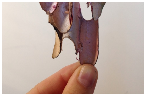
Eline Mugaas, Scale Model #11, 2015

LBS: This exhibition isn't just about showing the world an overlooked artist's oeuvre, is it? The new work you've done for the exhibition are 25 photographs of different parts of her scale models, displayed by your very visible hand.